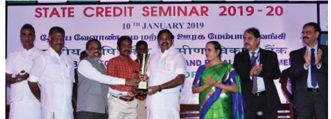
Vallalar FPC, supported by ESAF, won the second prize for its excellent performance among FPCs

International Financial Corporation, NABARD, SFAC are our partnering agencies in various farm sector initiatives